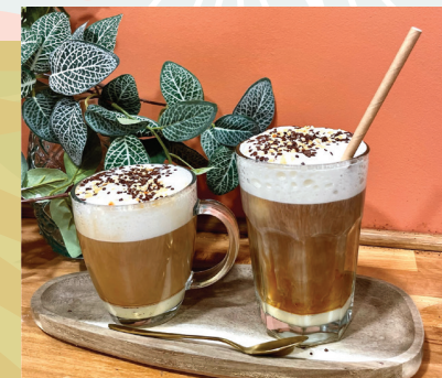
Café au lait façon brésilienne / Iced coffee