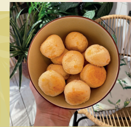
Pão de queijo