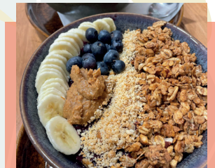
Açaí paçoca with blueberry