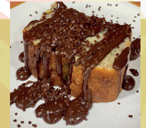
Banana Cake & brigadeiro