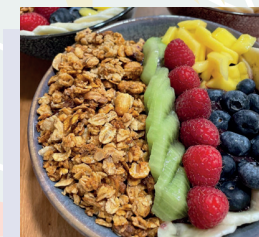
Açaí bowl - frutas