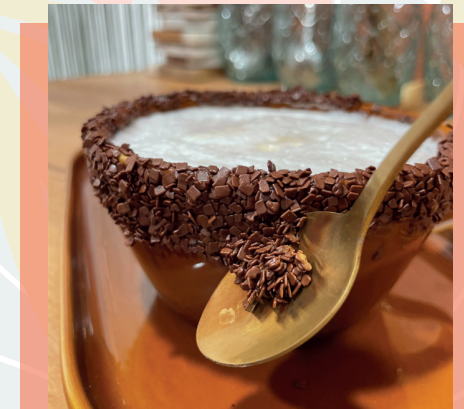
Coffedeiro / Chocodeiro

(toutes nos boissons sont disponibles avec du lait végétal + 0,50cts )